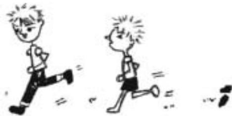
Figure 3: A Picture for the Antecedent Government Requirement Test

Otokonoko-no-otosan-wa hadasi-de hasitteimasuka. boy - Gen father- Nom barefoot-state is running ‘Is the father of the boy running barefoot?’