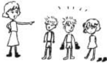
Figure 2: A Picture for Affected-theme Transitive Test

Since naraberu (line up) is an affected-theme transitive, it can be predicated of the direct object kodomo . The direct object in this picture is barefooted. Thus this sentence should be accepted.