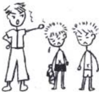
Figure 1: A Picture for Non-affected-theme Transitive Test

Otosan-ga kodomo-o hadaka-de okotteimasuka. father-Nom children-Acc naked-state is scolding ‘Is the father scolding his children naked?’