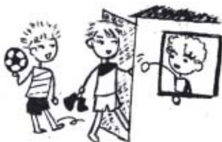
Figure 5: The Picture that Showed a Problematic Result

(22) Okasan-wa kodomo -o hadasi-de ireteimasuka. mother- Nom children -Acc barefoot-state let them in ‘Is the mother making the children enter the house barefoot?’